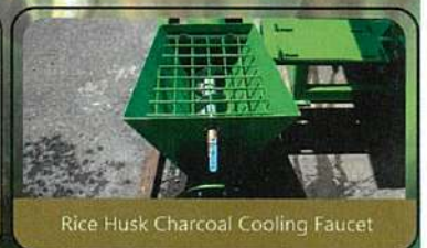
Rice Husk Charcoal Cooling Faucet