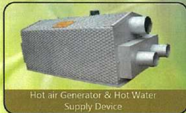
Hot air Generator & Hot Water Supply Device

Smoke is unnoticeable .Smoke doesn't release at times smell is inconsiderable. Depending on the size of rice husks not air is released. hot water can be produced too