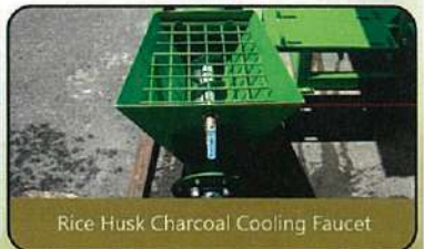
Rice Husk Charcoal Cooling Faucet