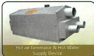
Hot air Generator & Hot Water Supply Device

Smoke is unnoticeable .Smoke doesn't release at times smell is inconsiderable. Depending on the size of rice husks not air is released. hot water can be produced too